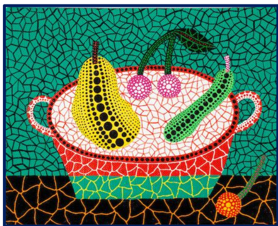
Yayoi Kusama - Fruit (1996)