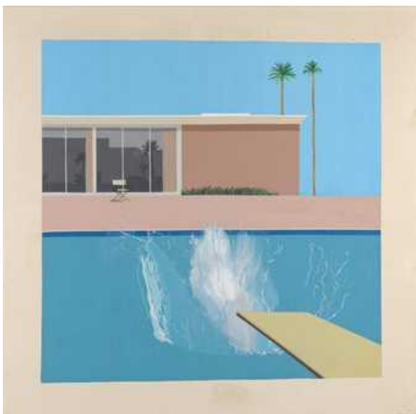
A Bigger Splash David Hockney (1967)