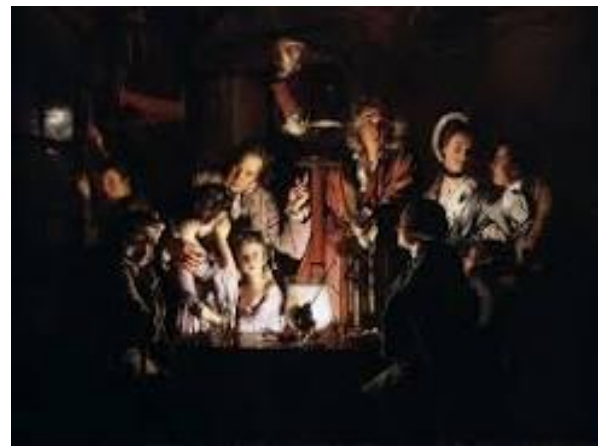
An Experiment on a Bird in the Air Pump (1768)

Joseph Wright (1734 –1797), was an English landscape and portrait painter from Derby, England. He was one of the first major English painters to have his career established outside of London and is known for his paintings of candlelit scenes and scientific and industrial subjects. He has been acclaimed as "the first professional painter to express the spirit of the Industrial Revolution".