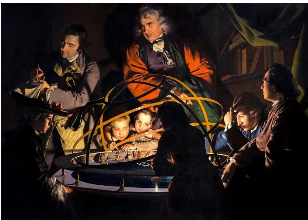
'A Philosopher Giving That Lecture on the Orrery where a Lamp is put in Place of the Sun' (1766)

This month's artist is: Joseph Wright of Derby – Born in Derby in 1734, Wright is an internationally renowned artist, whose paintings and works on paper adorn the walls of major galleries the world over.