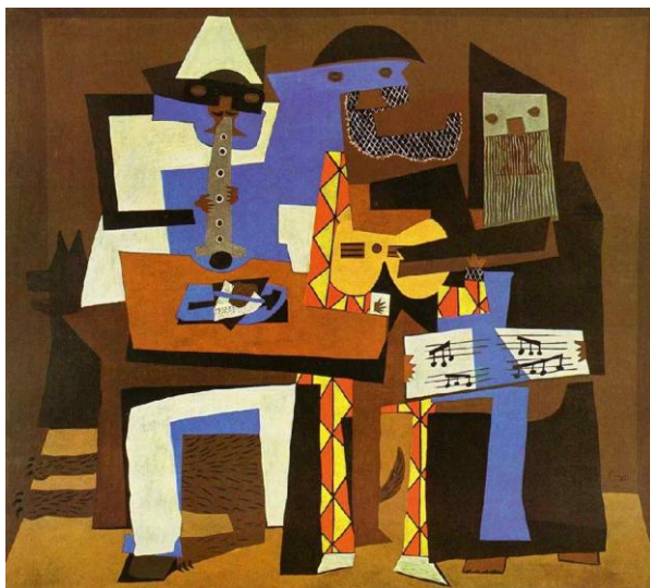
'Three Musicians' (1921)