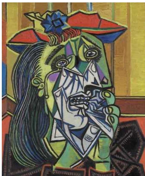
'The Weeping Woman' (1937)